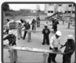
Bar bending & Steel Fixer Trade