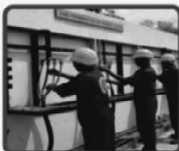
Construction Electrician Trade