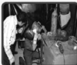
Fabrication- Pipe Welding Trade