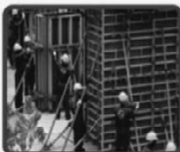
Formwork Carpentry Trade