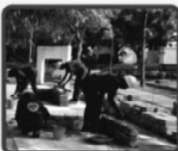
Advanced Masonry Trade